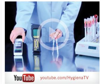
Watch an instructional demo at youtube.com/HygienaTV

MicroSnap Coliform is a rapid test for detection and enumeration of Coliform bacteria. The test uses a novel bioluminogenic reaction that generates light when enzymes that are characteristic of Coliform bacteria react with specialized substrates. The light generating signal is then quantified in the EnSURE luminometer. Results are available in 8 hours or less, depending upon required level of detection. Single figure organisms can be detected in 8 hours, delivering results in the same working day or shift.