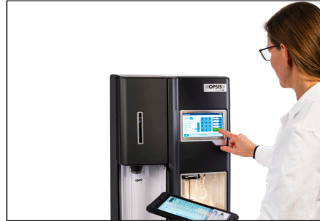
UPGRADE YOUR DISTILLATION SYSTEM TO AN ANALYZER AT A LATER STAGE