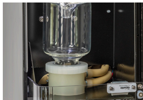
PROTECTION WITH BLACKLINE AS WELL AS PTFE COATING AROUND SENSITIVE PARTS. POLYPROPYLENE SPLASHHEAD OPTIONAL.

** OPSIS LiquidLINE BlackLINE coating is taken from latest development in Swedish corrosion technology. Similar coating is used in trucks and cars from Volvo and Scania.